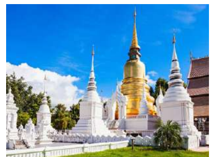
Wat Suan Dok Temple