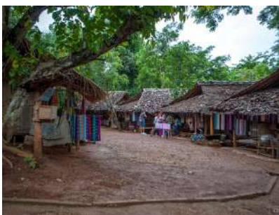
Karen Long Neck Village

Suggestion Flight: PG223 BKKCNX 09:55 11:15 (Airfare excluded on our price)