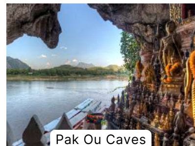
Pak Ou Caves