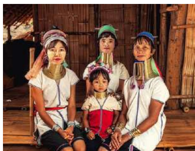
Karen Long Neck Village