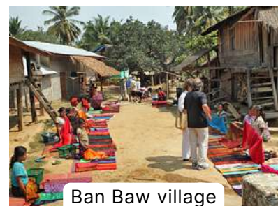
Ban Baw village